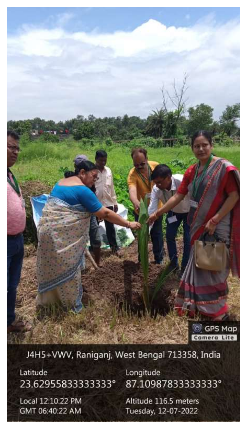
A plantation programme was also carried out in collaboration with Green Club of Raniganj on the same day